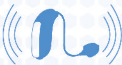
Hearing Aid Evaluations