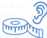
Hearing Aid Fittings