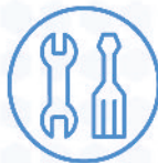
Hearing Aid Repairs