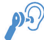
Full Audiological Evaluations

Visit www.pentadocs.com to request a telemedicine appointment today.*