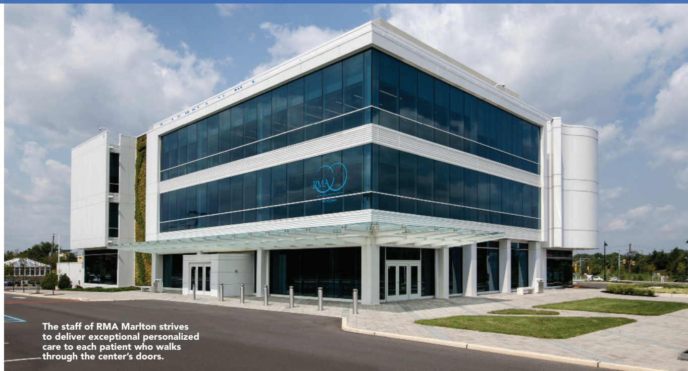
The staff of RMA Marilton strives to deliver exceptional personalized care to each patient who walks through the center's doors.