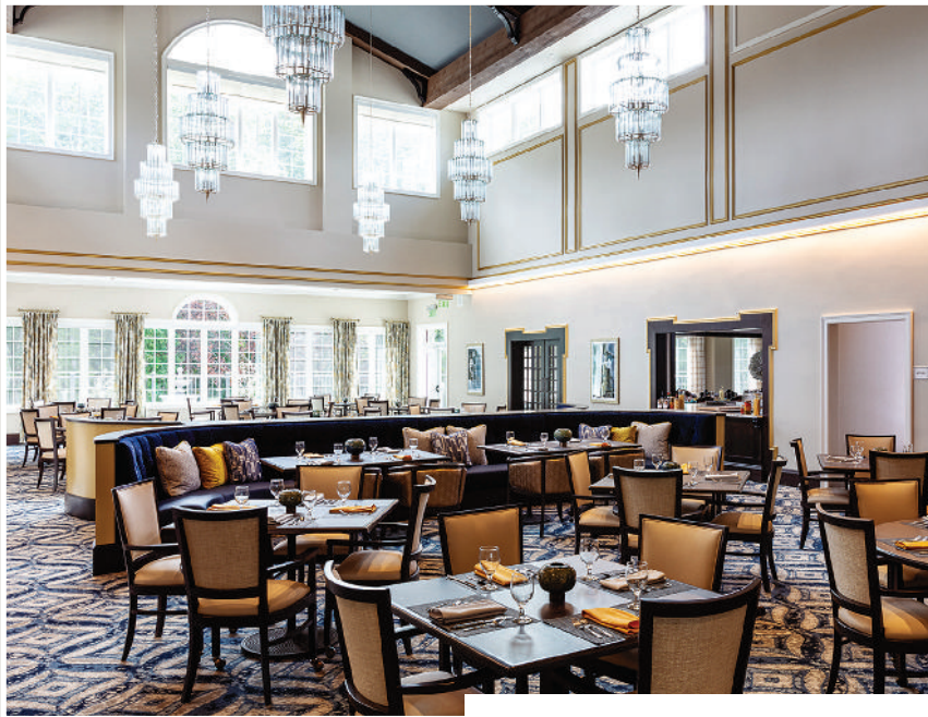
FIVE RESTAURANTS PROVIDE CULINARY OPTIONS RANGING FROM GOURMET FIVE-COURSE DINNERS TO CASUAL FARE.

fitness center, a full-service salon and spa, and valet services. Residents also benefit from an ongoing series of wellness classes, an assortment of physical exercises, and activities unique to the season; for example, the community recently hosted a raft of events around the spring holidays, including an Easter egg hunt and a Passover paint project. Participation in a variety of clubs provide plenty of opportunities to discover new interests and meet new people.