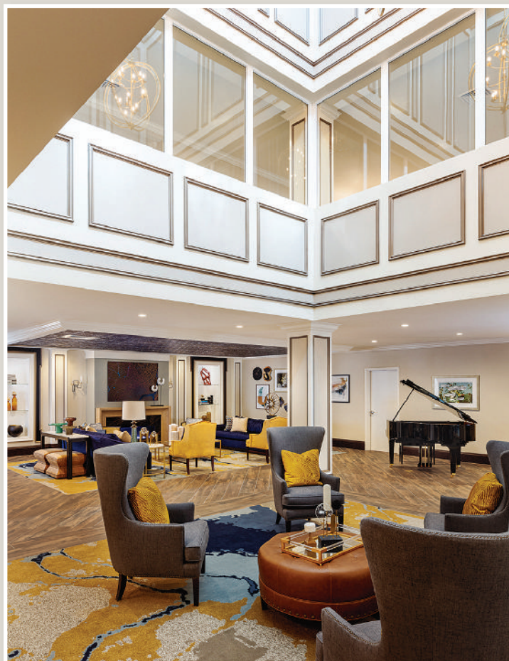
RESIDENTS ENJOY PREMIUM AMENITIES SUCH AS A FULL-SERVICE SALON AND SPA, A FITNESS CENTER, AND VALET SERVICES.

HarborChase of Princeton helps each resident lead a vibrant life in mind, body, and spirit. In addition to engaging on-campus programming, residents enjoy premium amenities such as a