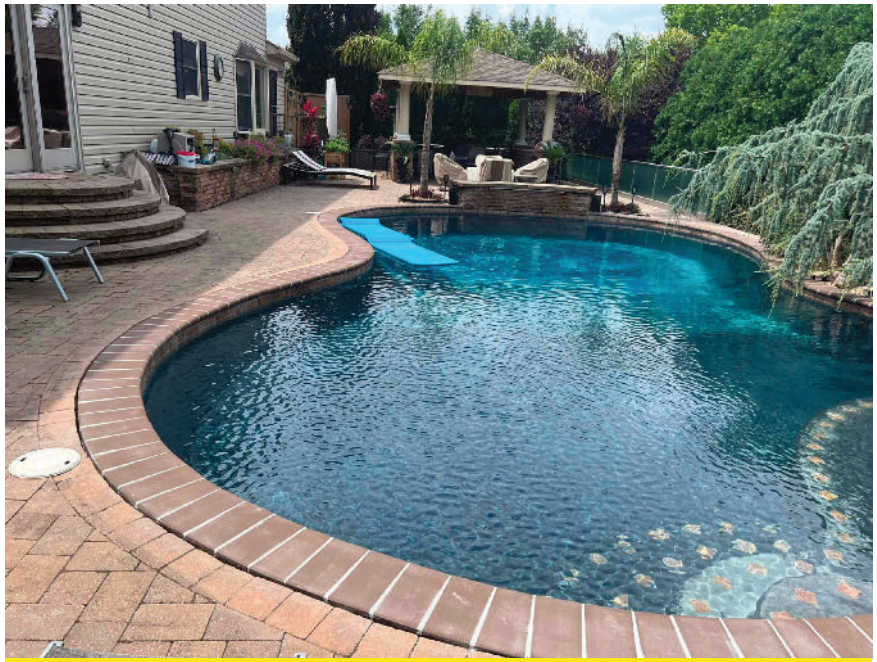
KS Pools & Patios has evolved into a one-stop shop handling all aspects of a backyard oasis.

"It's a burden to buy chlorine, store it in your shed, and maintain the pool," he adds. "A salt system creates chlorine gas and when you test the water, it says it has chlorine even though you didn't put any chlorine in it and didn't handle any chlorine. It's a lot less chemical work that you have to do once you have a salt chlorination system. The water is definitely softer, too, like what you have in your house."