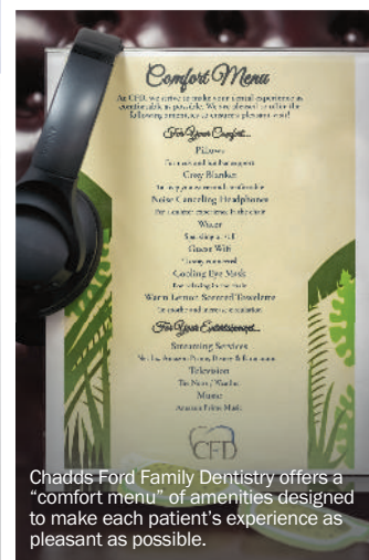
Chadds Ford Family Dentistry offers a “comfort menu” of amenities designed to make each patient’s experience as pleasant as possible.

has done well when she stands before a patient relaxing in the dental chair—often the same patient who came into the office with fear in their eyes—and sees a smile stretching from one ear to the other. ■