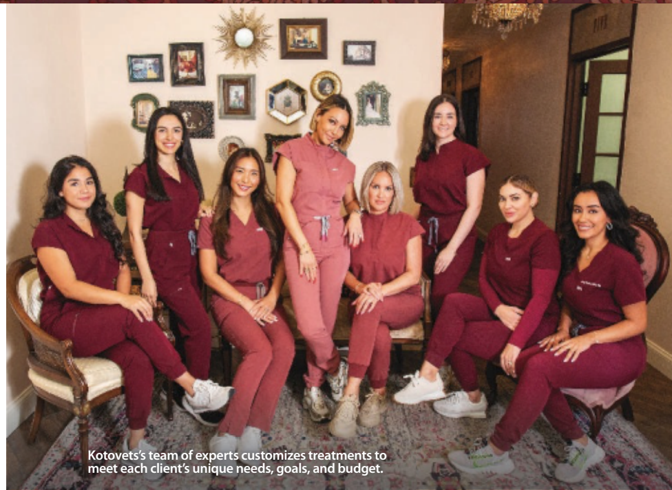
Kotovets's team of experts customizes treatments to meet each client's unique needs, goals, and budget.

help them optimize and maintain long-term results.