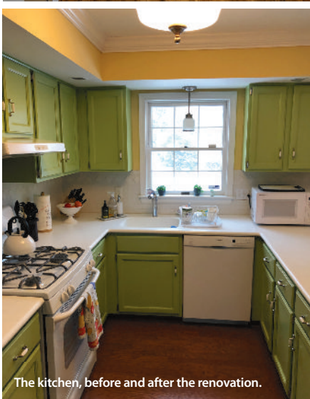
The kitchen, before and after the renovation.

A kitchen renovation performed by Gehman Design Remodeling enhances the aesthetics and functionality of a home's entire first floor.