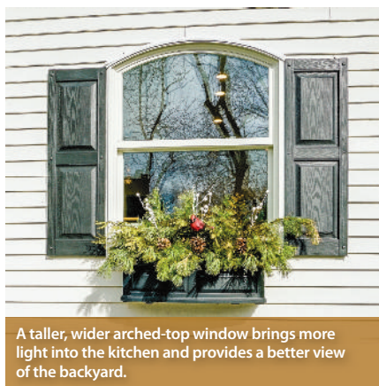
A taller, wider arched-top window brings more light into the kitchen and provides a better view of the backyard.