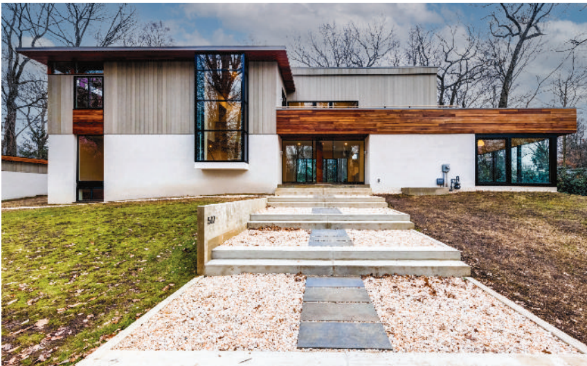
The Bloomfields' shared enterprise, Portfolio, designs and builds modern houses that feature dramatic forms with soaring spaces filled with natural light.