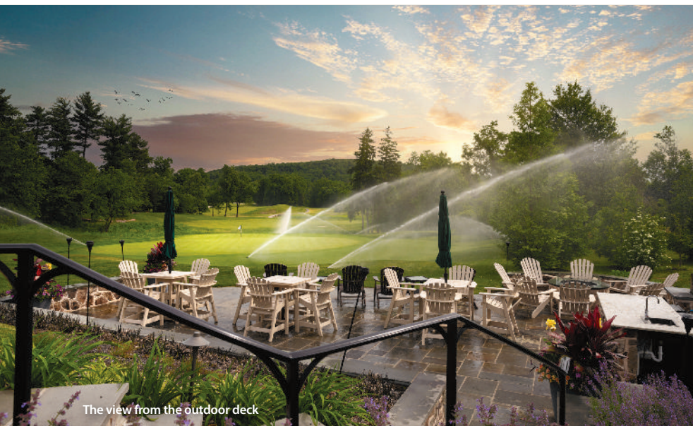
The view from the outdoor deck