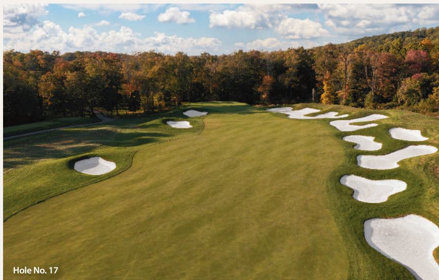
Hole No. 17