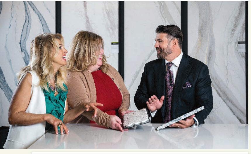
Colonial Marble & Granite welcomes prospective clients to visit its King of Prussia showroom to discover the possibilities. The in-house design team will guide them through the process of creating a compelling and customized design that stands the test of time.

disparate elements must exist in harmony. For example, when projects combine different kinds of stone, she says they must complement one another in order to add richness, depth, and distinction.