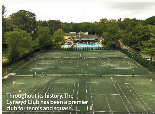
Throughout its history, The Cynwyd Club has been a premier club for tennis and squash.

Both pastimes remain in high demand to this day. The Cynwyd Club boasts eight Har-Tru tennis courts, hosting everything from members-only round-robin tournaments to clinics/lessons for kids and adults, thanks to a partnership with High Performance Tennis Academy, also based in Bala Cynwyd. Indoors, the club has five international softball squash courts and two doubles courts, which are heated and air-conditioned for year-round play.