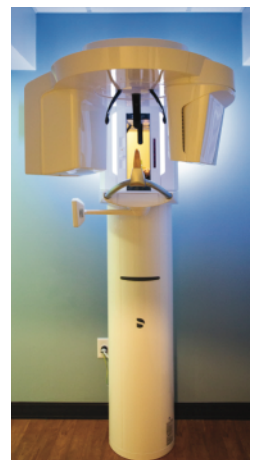
Advanced technology to help treat problems associated with the under-development of the jaws and bones of the midface include specialized visualization software, an unobtrusive “sleep ring,” and 3D CBCT.